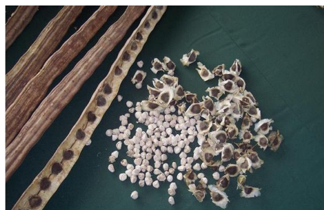
Fig. 1. Moringa oleifera pods and seeds [23, 27]

sample was obtained from package water (“Supreme pure water”), and the final sample was from a borehole located at the Federal University of Technology, Minna, Nigeria. The water samples were collected on the same day within one hour (7:00 am – 8:00 am). The collection of water samples at this particular time of the day was to ensure that the rising sun does not affect the quality (parameters of interest) of the water to be investigated. The containers used for the collection of samples were empty and washed thoroughly with distilled water and rinsed with the specific sample to be collected. The dry M. oleifera pods were obtained from Minna, Nigeria, as the green pods do not possess any coagulation activity [8]. Next, the dry seeds of M. oleifera were selected from the pods that were collected as shown in Fig. 1. The seed coat and wings were mechanically removed before pulverisation and sieving using an analytical sieve (250 \mu\text{m} ) according to the method reported in the literature [28].