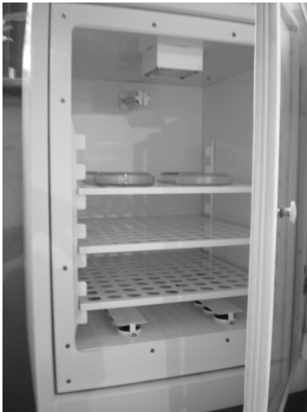
Fig. 1. The thermostat for microorganisms growth. Conditions: incubation in a thermostat at 37\text{ }^\circ\text{C} during 48 h

Gases were used as additional gases for the researches, which were bubbled into the microbial dispersion at the rate of \sim 1\text{ cm}^3/\text{s} . The duration of the process was 2 h. The volume of the investigated dispersion ( 75\text{ cm}^3 ) in the glass reactor was cooled by water during the whole process.