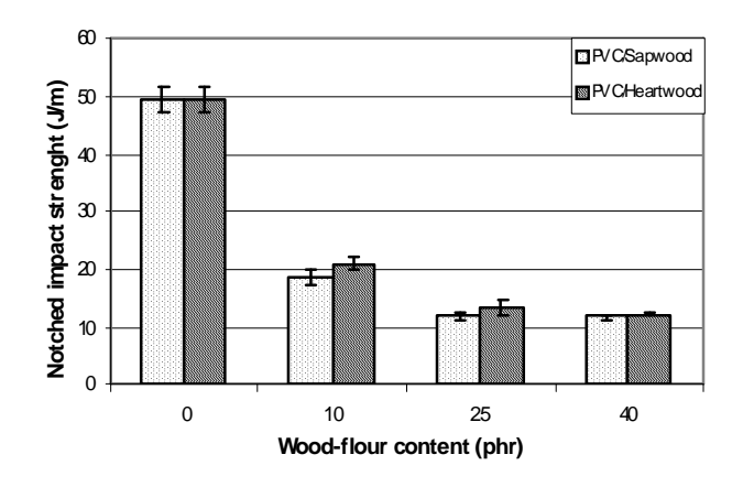
Fig. 2. Impact strength of PVC/wood flour composites as a function of wood type and wood content